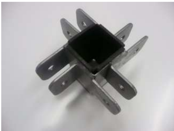
Sliding Mast Bracket