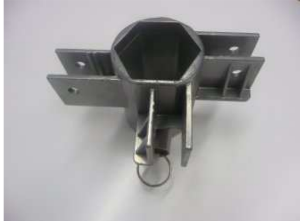
Sliding Middle Leg Bracket from a 3M x 6M