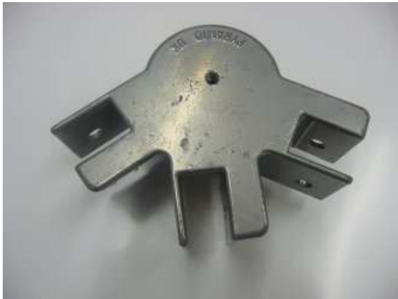
Top Leg Bracket from 6M Hex Model