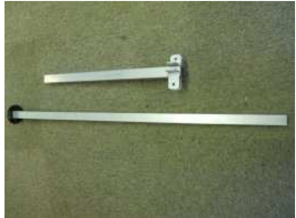
Upper & Lower Mast Poles