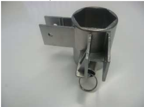
Corner Pull Pin Bracket