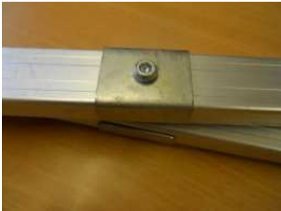
Cross Bar Saddle and Bolt