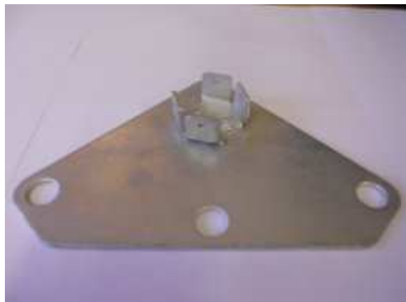
Lower Foot Plate