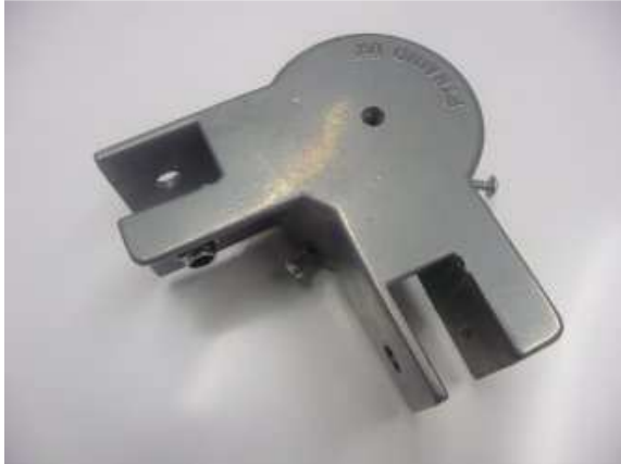
Top Corner Bracket