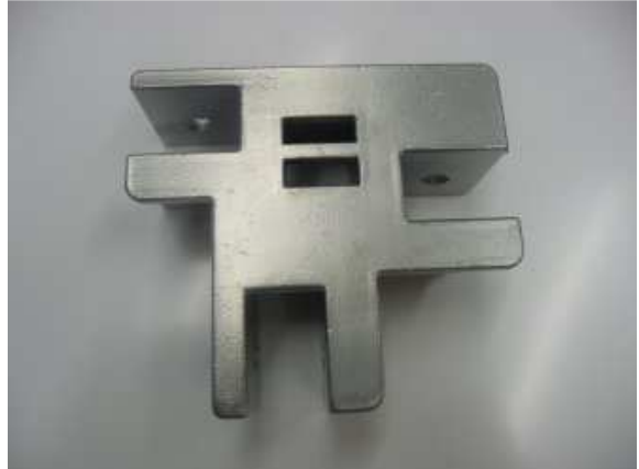
Cross Bar Joining Bracket