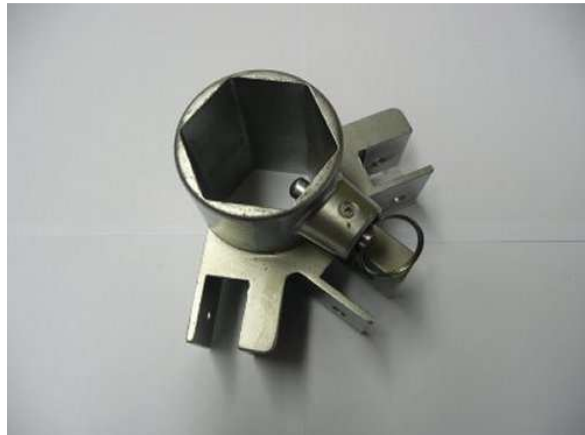
Sliding Leg Bracket from 6M Hex Model