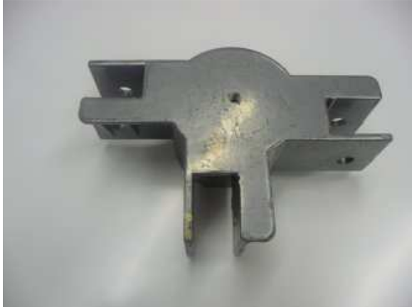
Top Bracket from Middle Leg on a 3M x 6M