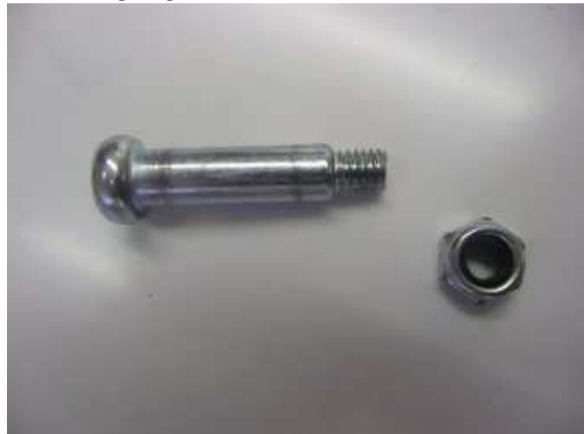
35mm Nylock Nut and Bolt