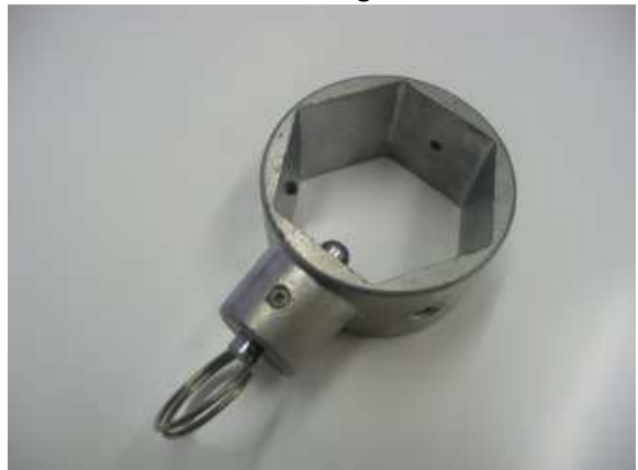
Collar and Pin