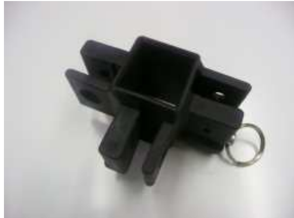
Sliding Middle Leg Bracket from a 3M x 6M