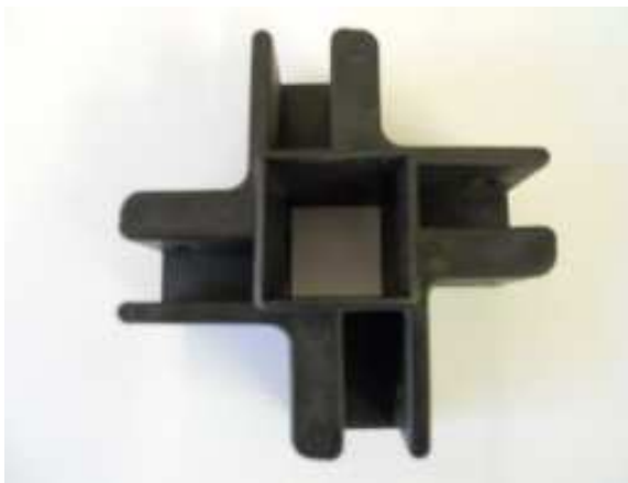
Sliding Mast Bracket