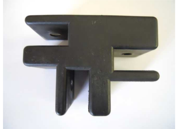
Cross Bar Joining Bracket