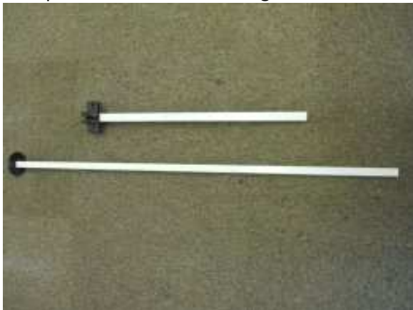
Upper and Lower Mast Poles