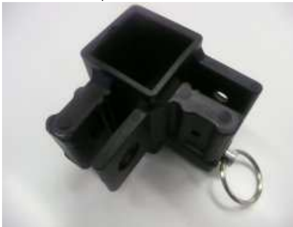
Corner Pull Pin Bracket