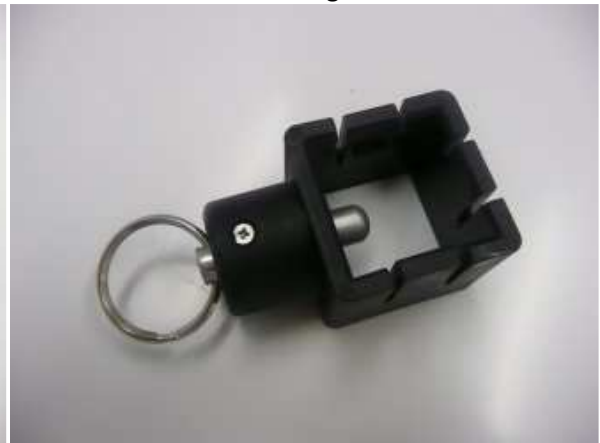
Collar and Pin