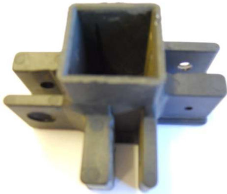
Top Bracket from Middle Leg on 3M x 6M