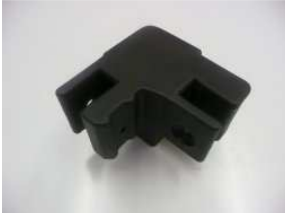
Top Corner Bracket